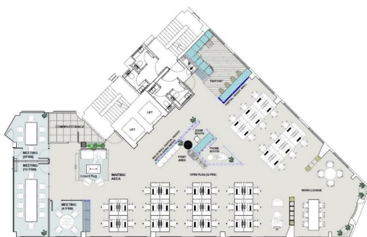
3 rd Floor Layout